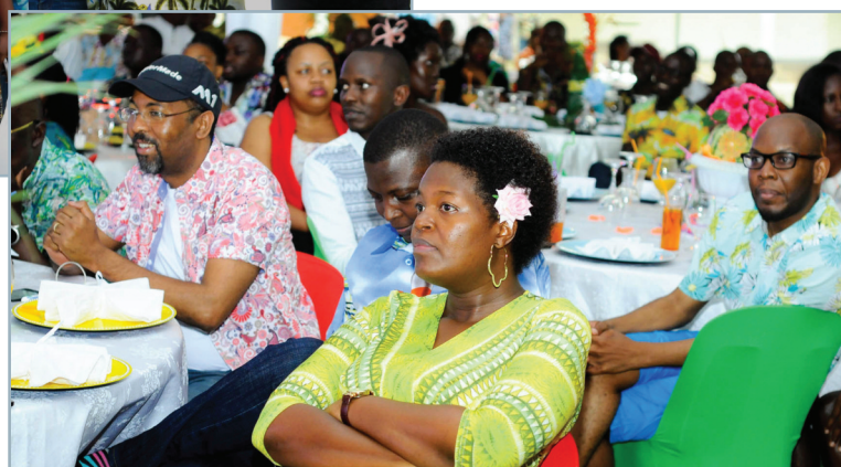
Staff recreation Day