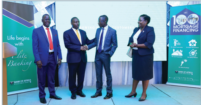
"Elite banking" launch