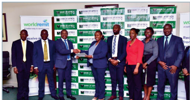
"Word Remit" launch