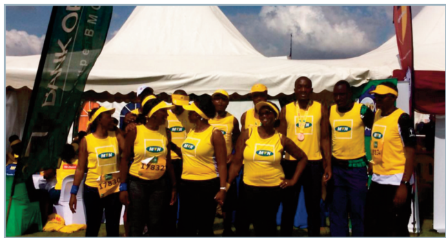
MTN marathon participation