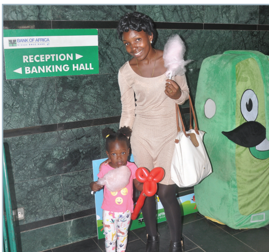
"Tots & Teens Banking day"