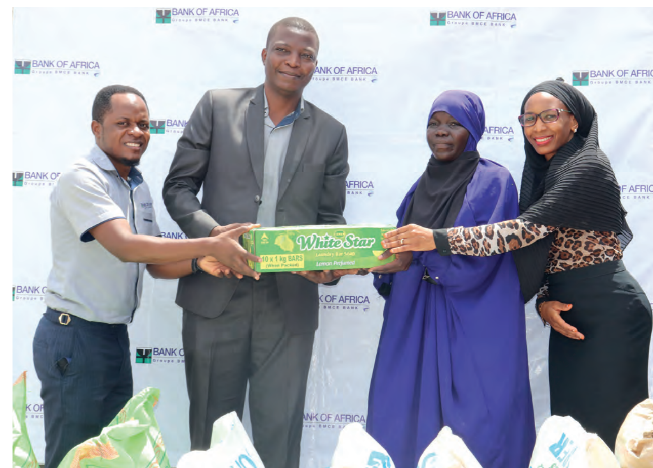
Appointment of the bank to «Cosumers Choise Awards»