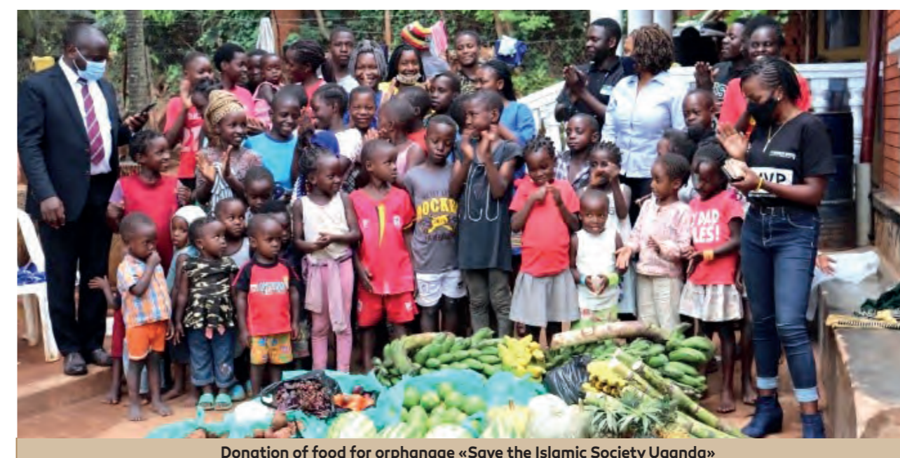
Donation of food for orphanage «Save the Islamic Society Uganda»

We remain committed to the goals championed in our mission; to promote growth and stability of our nation, but also strongly champion an inclusive recovery environment that works for all our stakeholders.