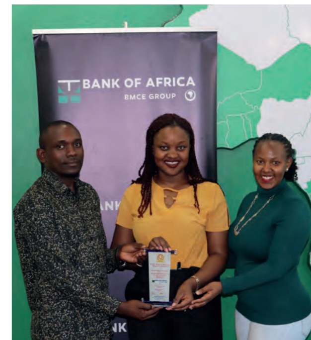
Remise du prix de la qualité à la banque