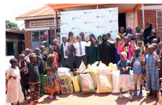
Donation to communities during the month of Ramadan

Participation in the MTN Kampala marathon 2022 whose proceeds were to meant to upgrade maternal and new born services in health facilities across the country