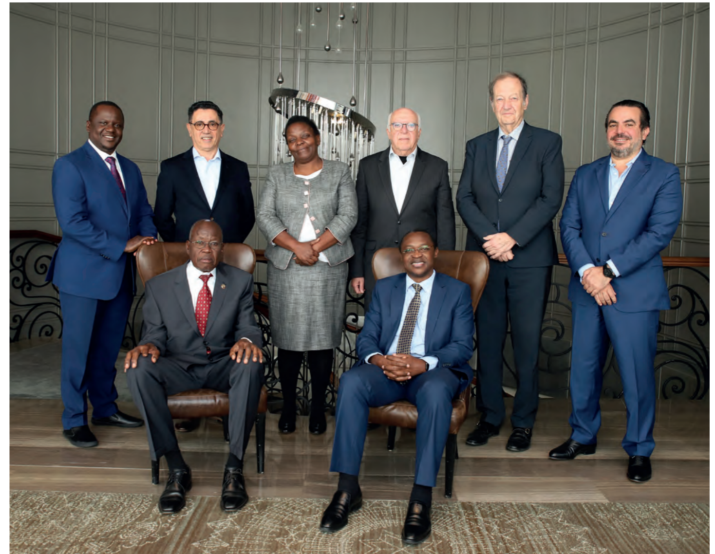
Le Conseil d'Administration de BOA-UGANDA

BANK OF AFRICA House, Plot 45, Jinja Road P.O. Box 2750 - Kampala - UGANDA Tel.: +(256) 414 302 001 - Fax: +(256) 414 230 902 SWIFT: AFRIUGKA