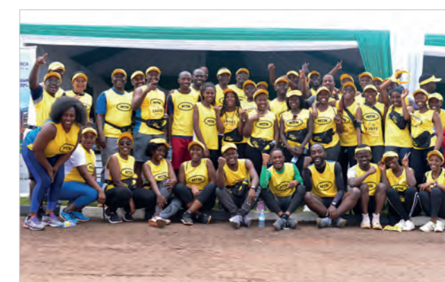
Participants in the MTN Marathon