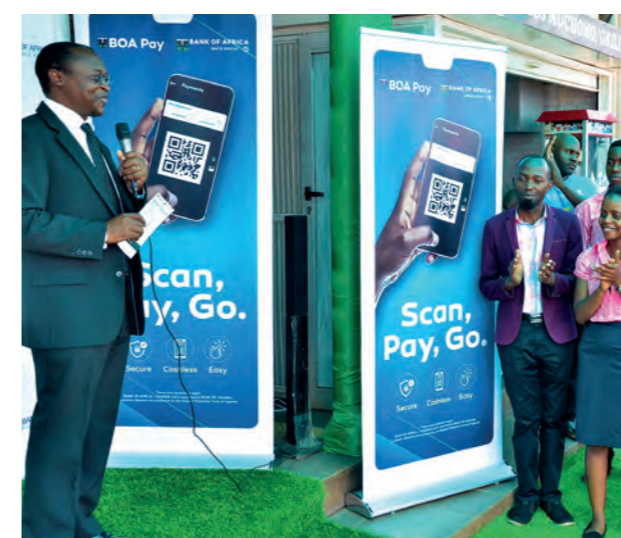
Lancement de la fonctionnalité BOA Pay au Mobile Wallet