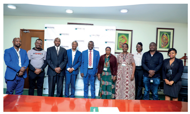
The Bank rewards some of its best customers